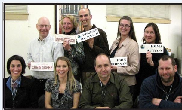
Pictured left: Crockett Community Foundation 'past and newly elected' Board Members. Photo taken during the swearing-in ceremony at the January 2011 meeting.

Crockett Community Foundation P.O. Box 155 Crockett, CA 94525 Tel: 510-787-9708 Fax: 510-787-1346 Email: info@crockettcommunityfoundation.org Website: www.crockettcommunityfoundation.org