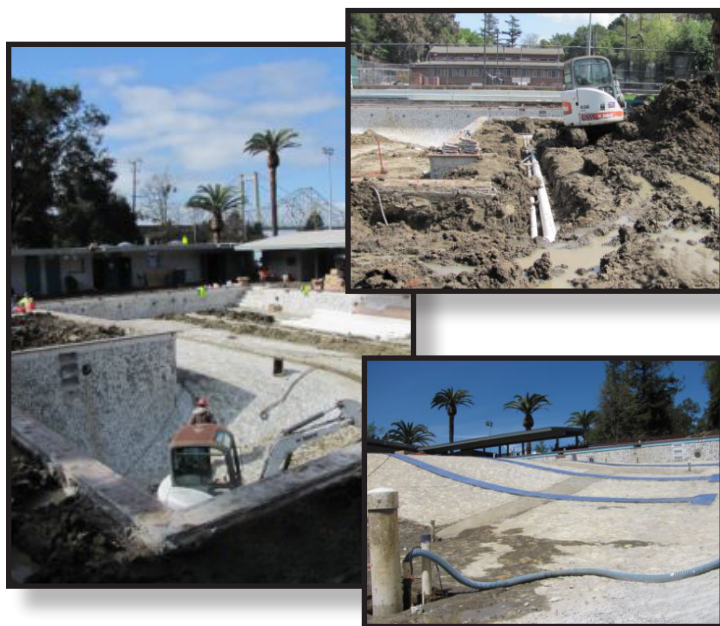
Above: This year's pool renovation project in progress.

The Crockett swimming pool was built in 1966. In 2016 the swimming pool will be 50 years old. The plumbing needed to be upgraded to meet current California standards. The standard is that the water in the pool must be filtered at a rate of four times in a 24-hour period. Currently, the pool barely filters the water at a rate of three times in a 24-hour period. The Crockett Recreation Department was fortunate enough to receive a grant of $207,144 from the East Bay Regional Parks District for this project from Measure WW funds. This project will replace the plumbing in the pool, filter and pump to meet state requirements for the filtration of the water. The pump will be a variable speed pump, reducing the amount of electricity used to operate the pump, which in turn will reduce operating cost. New LED lights will be installed in the pool which will also reduce the amount of electricity needed to operate the lights and reduce operating costs. The crumbling concrete deck around the pool will also be replaced. The chain link fence around the perimeter of the pool will be replaced to meet state requirements. New Americans with Disabilities Act (ADA) swimming pool guidelines become mandatory in March 2012. To comply, handicapped accessibility will be improved by renovating the outside showers and the installation of a lift.