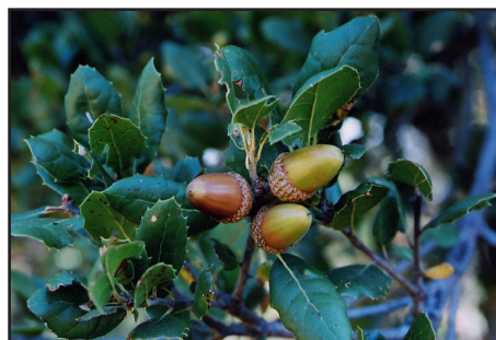
Pictured: Coast Live Oak

This project will result in a safer bathing environment for those who use the swimming pool. New equipment will be installed which will result in lower operating costs. The pool and deck will last another 50 years.