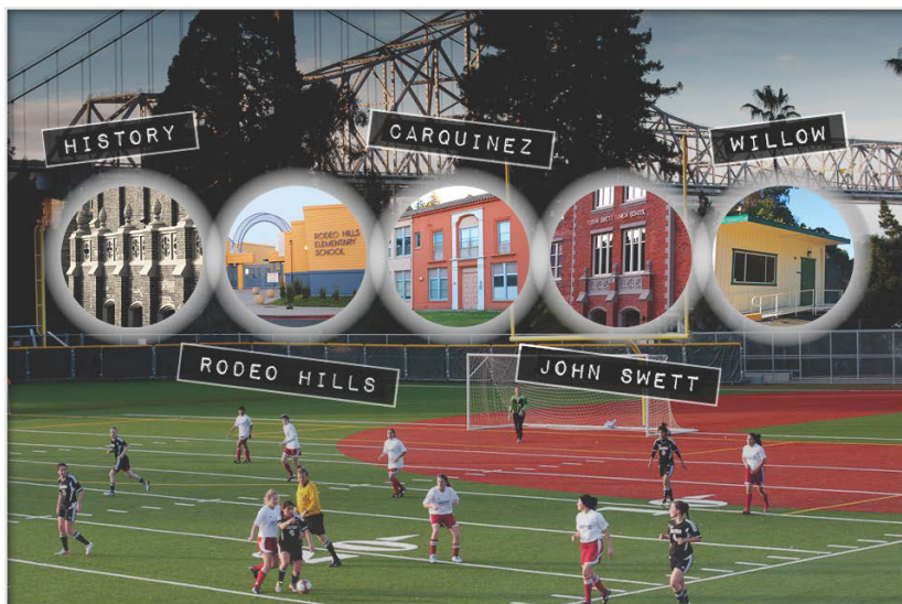
The John Swett Education Foundation uses innovative means to help fund local school programs jeopardized by budget shortfalls.